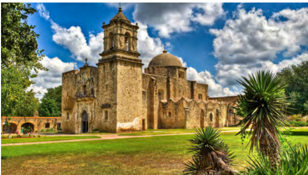
Mission San Jose

6701 San José Drive, San Antonio, TX 78214