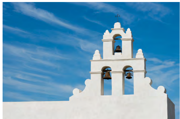
Mission San Juan